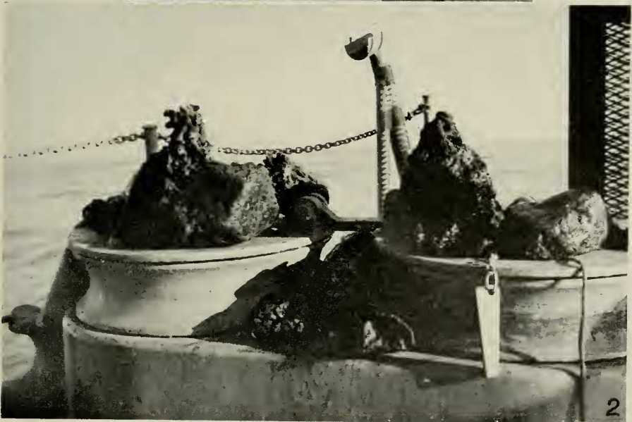
Figure 1. A large piece of Miocene chert greatly bored by marine organisms, mostly worms. The pencil shows the scale. From 70 fms., northwest of Middle Farallon Island July 16, 1950, Fish and Game vessel N. B. Scofield .